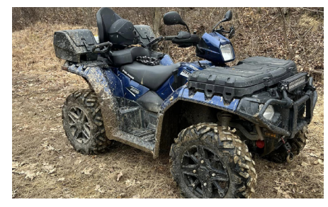
By Lukas Zelenak