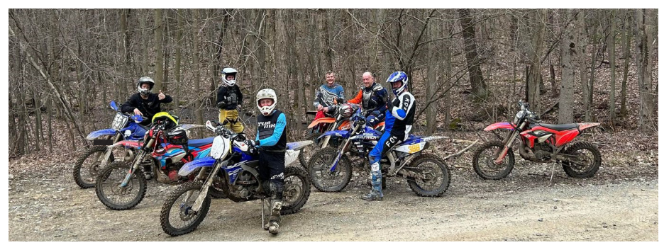
By Rory Eutsey